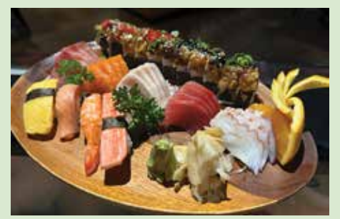
Sushi Sashimi Combo for 2