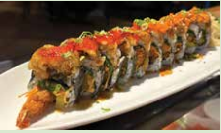
Sexy Women Roll