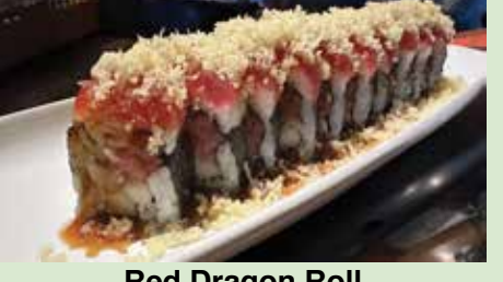
Red Dragon Roll