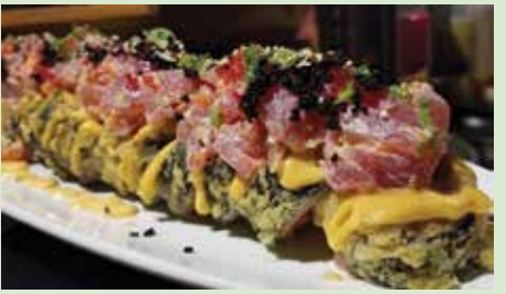
The Bomb.com Roll