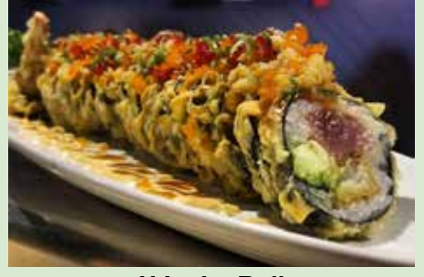
U La La Roll